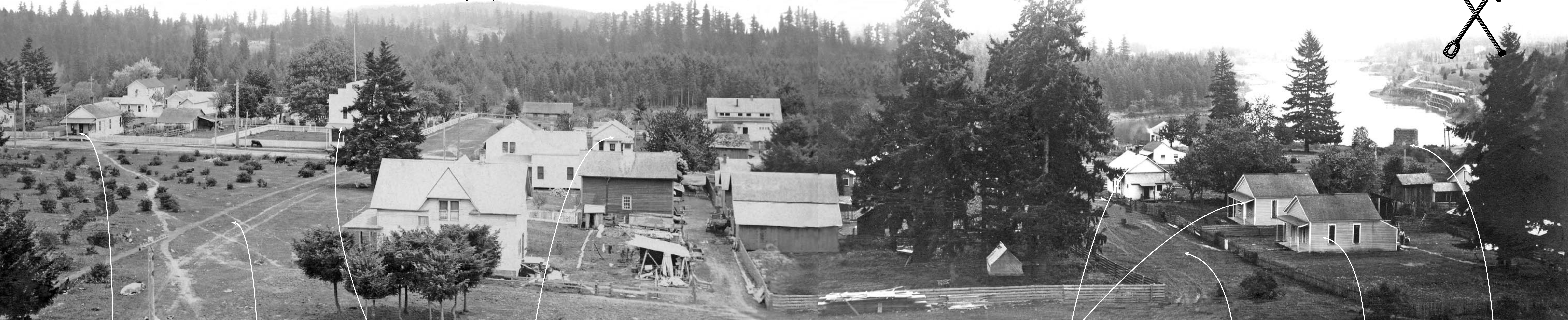
Prosser's Store and Post Office (built as a worker's cottage)